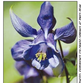
THE COLUMBINE – COLORADO STATE FLOWER

Visit the FARB website at www.FARB.org for more information regarding FARB and its meetings.