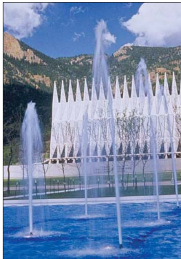
UNITED STATES AIR FORCE ACADEMY CHAPEL AND FOUNTAIN

The 16th annual Attorney Certification Seminar will be held in Colorado Springs, Colorado, at the Antlers Hilton. The Antlers Hilton Colorado Springs hotel offers stunning views of the Rocky Mountains and Pikes Peak. Beyond the front door is lovely downtown Colorado Springs, inviting you to take a leisurely stroll to parks, museums, unique shops, and restaurants. General William Jackson Palmer founded the city of Colorado Springs in 1871. His intent was to create a posh resort community featuring a luxury hotel and tree-lined boulevards. Over 100 years later, in its third rendition of that historic hotel, Antlers Hilton Colorado Springs still maintains its prominence as the hospitality leader in Colorado Springs. The AAA 4-diamond, 292-room hotel offers 27,500 square feet of meeting space, a 54-seat learning center, a fitness room, an indoor swimming pool, a beauty salon, and several dining options. Visitors to the Antlers Hilton Colorado Springs may enjoy Pikes Peak with its spectacular scenery and breathtaking views, take a short drive to the Air Force Academy, the most visited destination in Colorado and home to over 4,000 cadets, or tour the United States Olympic Complex, home of 20 sports federations and a training center for young athletes.